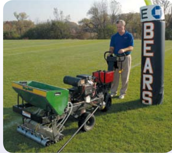
CHICAGO BEARS PRACTICE FIELD