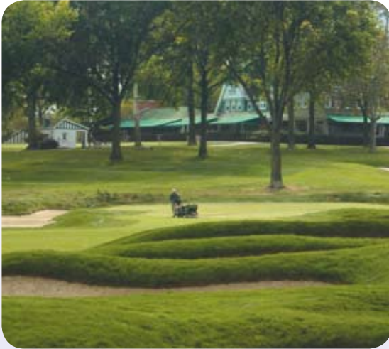
OAKMONT COUNTRY CLUB

Turf managers at some of the most prestigious golf courses and sports fields in the nation have already discovered the DryJect® difference. In fact, 10 of the top 15 golf courses from Golf Digest's 2006 Top 100 courses* use DryJect.